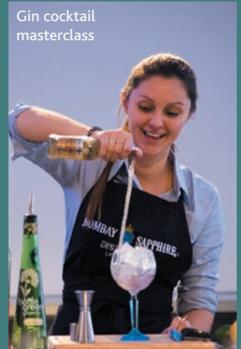
Gin cocktail masterclass

Fashion Museum Bath, the Roman Baths and Victoria Art Gallery!